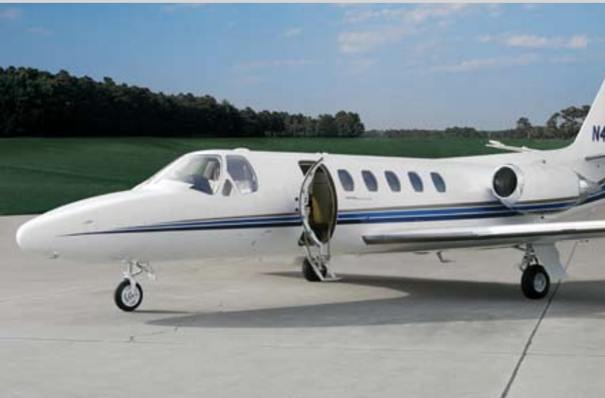
Citation S/II Exterior ▲ Hawker 850XP Interior ▼

Travel Management's fleet operates over thirty aircraft including Hawker 400XP, Hawker 850XP, Cessna Citation S/II and 400 Beechjet.