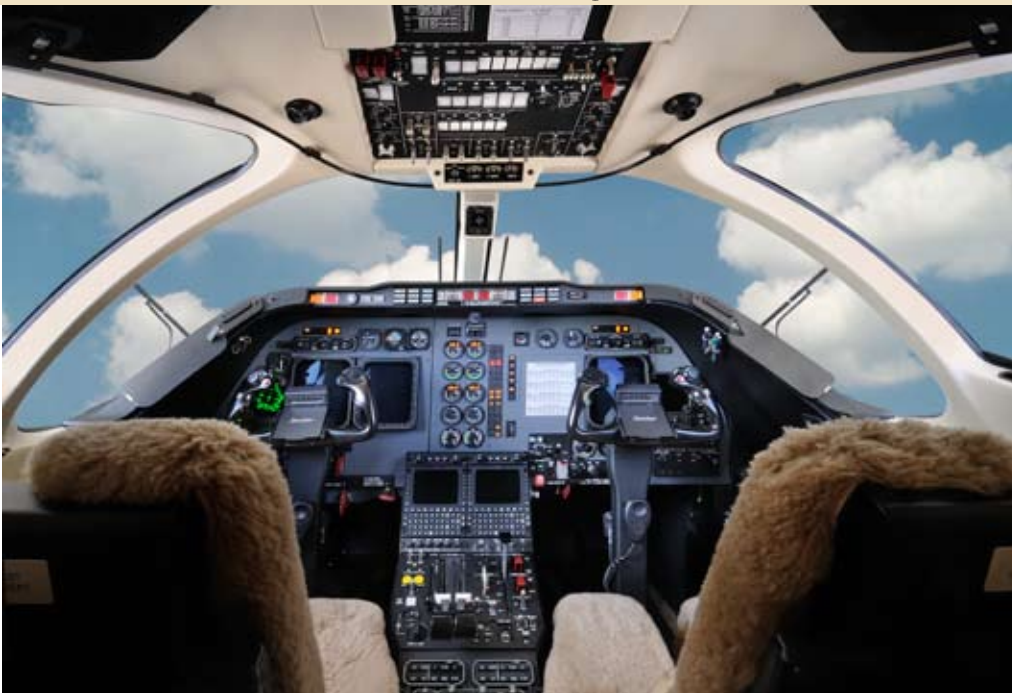
Hawker 400XP Cockpit ▼