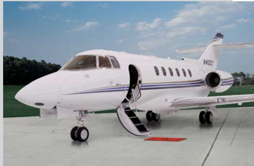
Hawker 400XP Exterior ▼