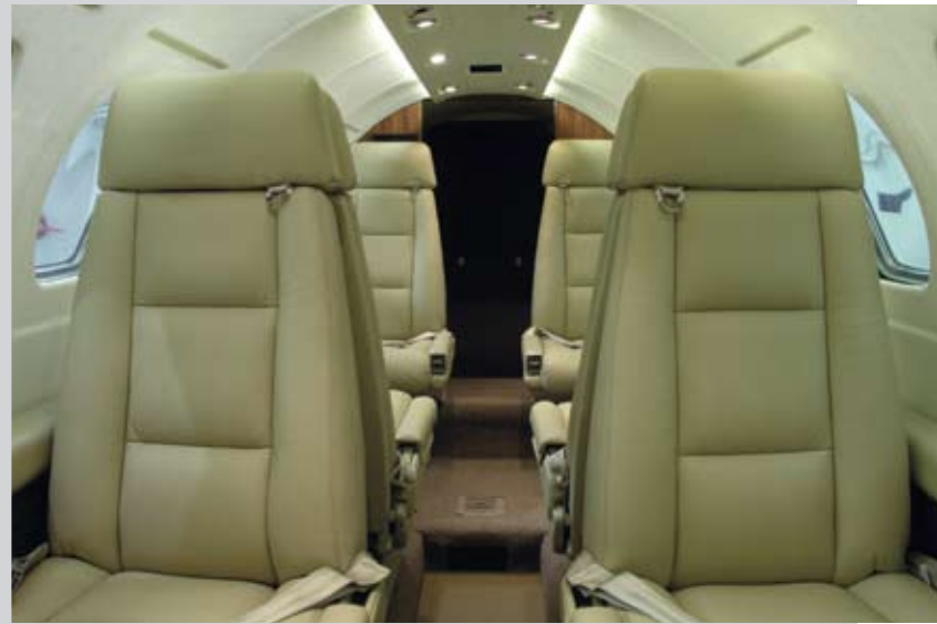
Citation S/II Interior ▲ Hawker 850XP Exterior ▼